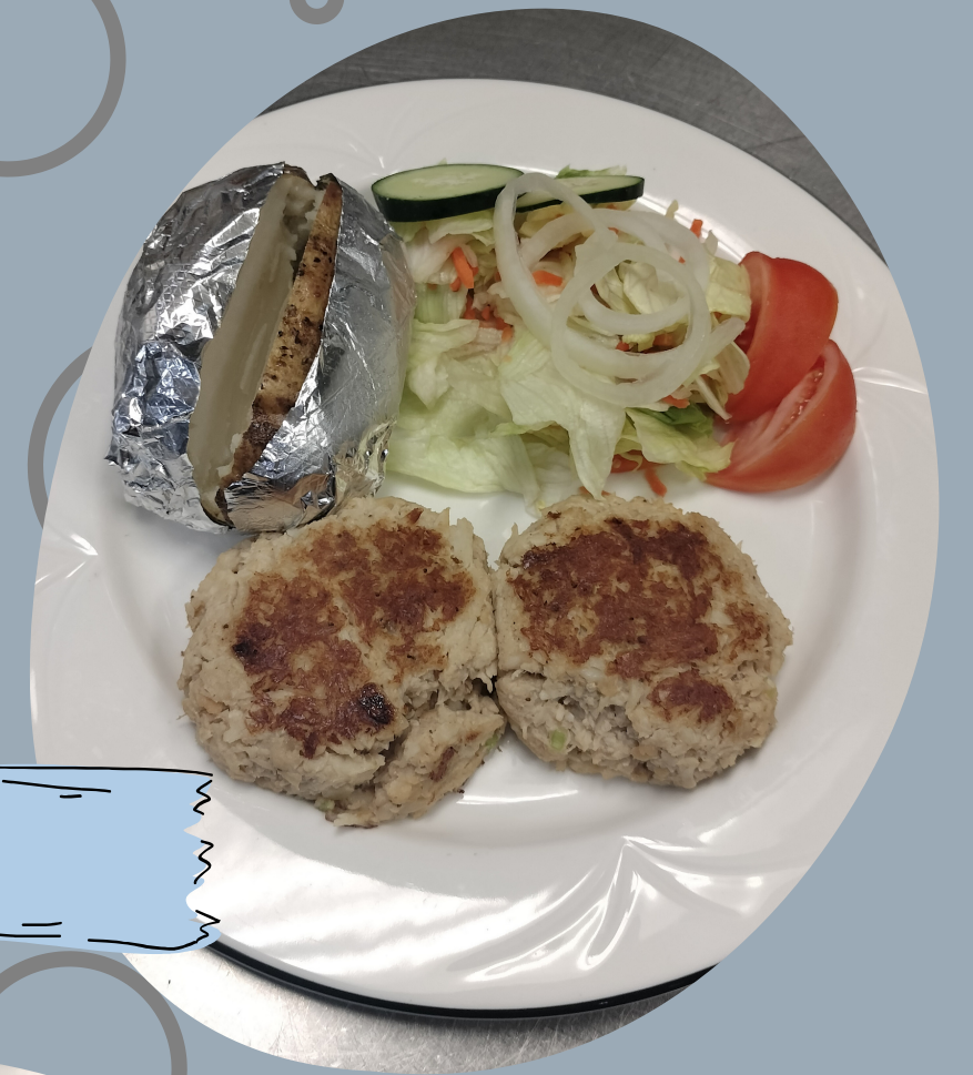
BROILED CRAB -CAKES